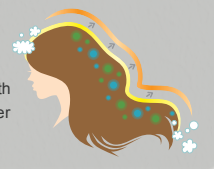
<All images are illustration purpose only>

In general, styling ingredients go directly on the hair and causes stickiness. With the water-retaining film of meadowfoam seed oil, styling ingredients no longer stick directly to the hair, which makes it easy to wash off with warm water.