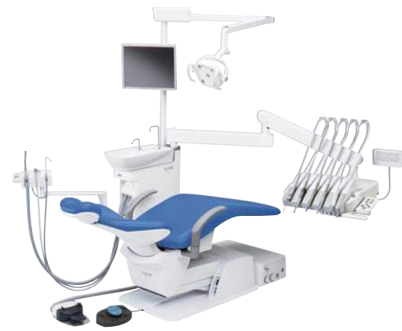
Chair mounted Continental type