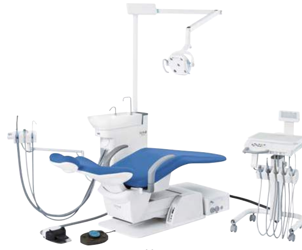
Cart Holder type