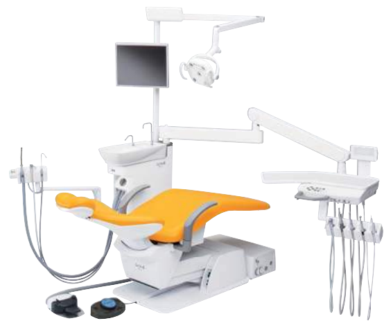
Chair mounted Holder type